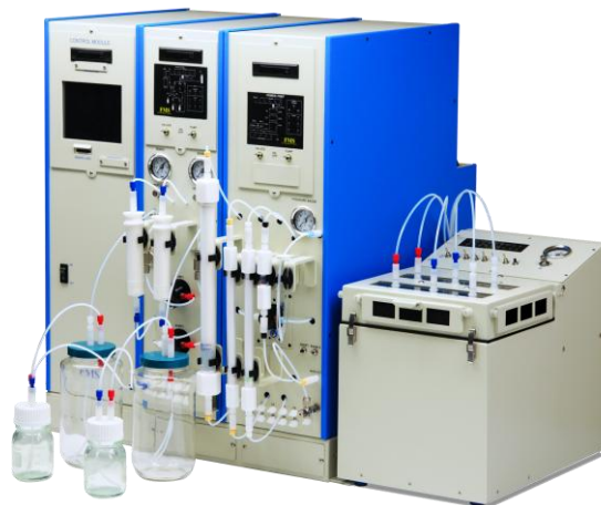
EconoTrace™ Solid Phase Extraction System PowerPrep™ Multi-column Sample Cleanup Module SuperVap™ Evaporation and Solvent Exchange Module