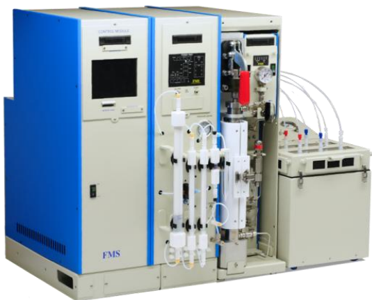
PLE™ Pressurized Liquid Extraction Module PowerPrep™ Multi-column Sample Cleanup Module SuperVap™ Evaporation and Solvent Exchange Module

Simultaneously perform eight sample extractions, cleanups, and concentrations in less than two hours.