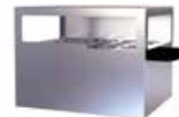
DI-010-A, Rack 10 DI-020-A, Rack 20