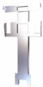
DI-050-A1, Fixed cooling stand 10 DI-050-A2, Fixed cooling stand 20 to mount on Digester Auto, for both Tube Rack and Exhaust

The KjelROC Digestion portfolio offers something for most labs