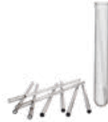
TU-222-A, Boiling Rods