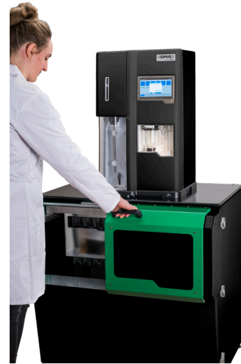
IT IS EASY TO INSERT A TUBE RACK INTO THE AUTOSAMPLER. A FRONT DOOR PROTECTS THE OPERATOR DURING OPERATION.