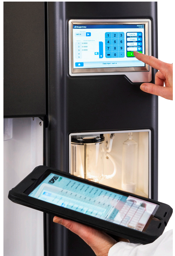
THE LABCONNECT SOFTWARE ALLOWS FOR EASY CONNECTIVITY TO YOUR LABORATORY