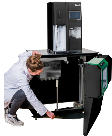
IT IS EASY TO OPEN AND CLEAN THE AUTOSAMPLER INSIDE.